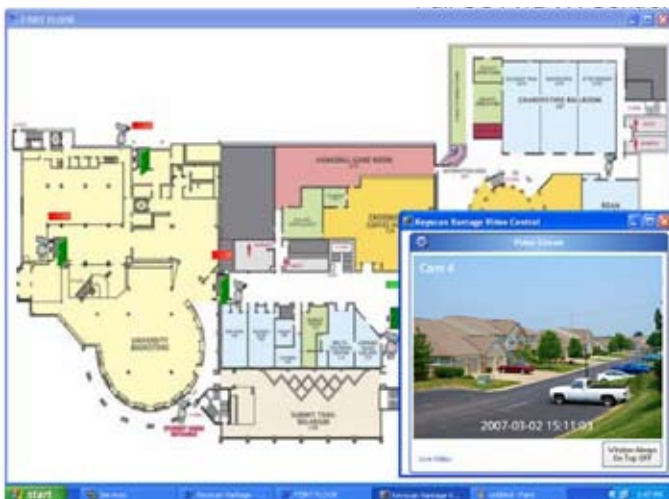
Active map with CCTV Integration

And you are up and running! It's just that easy!