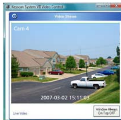
Live Feed with No Camera Controls