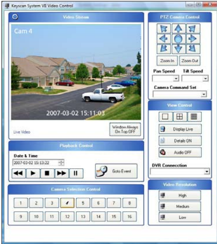
Full CCTV/DVR Controls